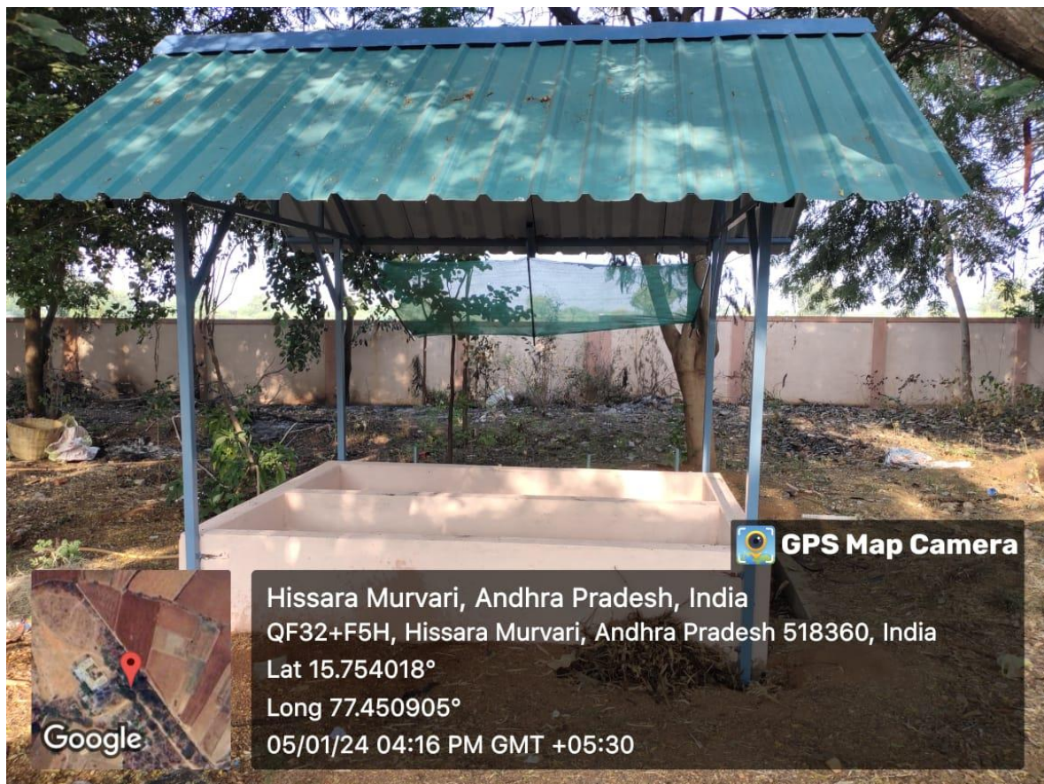
Vermicompost Unit in the Campus

The Geo-tagged Photographs of Vermicompost unit in working condition are presented here.