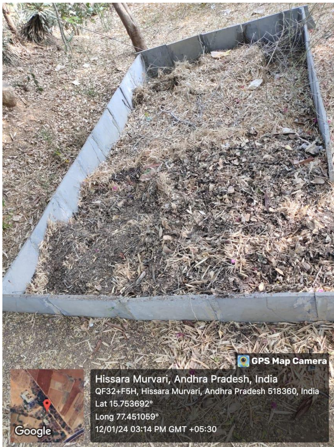
COMPOST PITS BESIDES CHEMISTRY DEPARTMENT