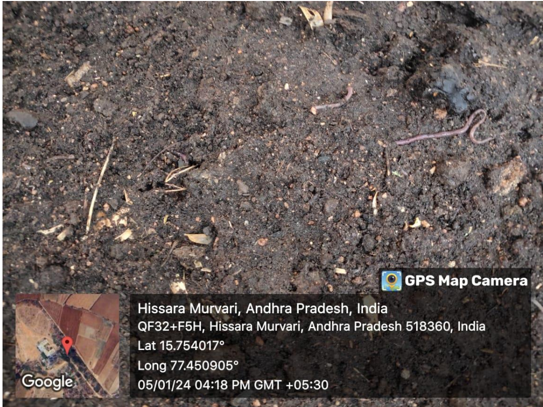
Earthworms in the Vermicompost Unit - After Watering